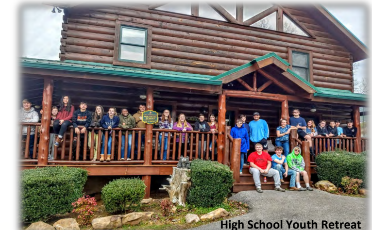
High School Youth Retreat