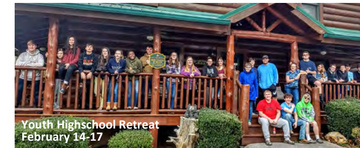
Youth Highschool Retreat February 14-17