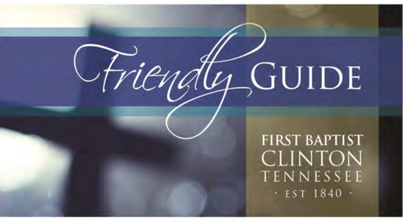
~ DECEMBER 2019 ~